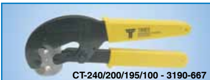
CT-240/200/195/100 - 3190-667

* Finish metals: N=Nickel, S=Silver, G=Gold, SS=Stainless Steel, A=Alballoy **VSWR spec based on 3 foot cable with a connector pair