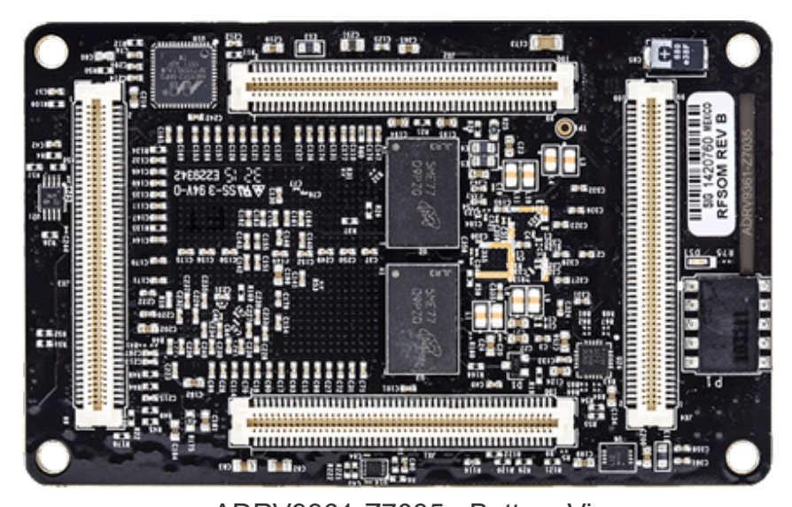
ADRV9361-Z7035 - Bottom View